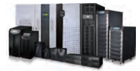
Delta offers a full range of UPS solutions from 600 VA to 4000 kVA to fulfill your power security needs.

HPH-B: UPS integrated battery model has batteries inside HPH-BN: UPS integrated battery model has no batteries inside