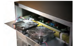
Redundant fan design enhances system reliability*